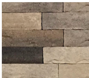
SHELBY (BODY COLOR)