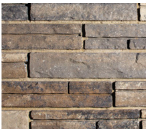
SIENNA (BODY COLOR)