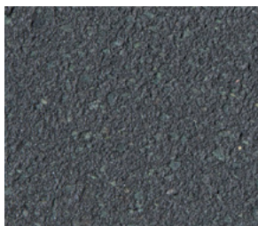
MIDNIGHT (ACCENT COLOR)